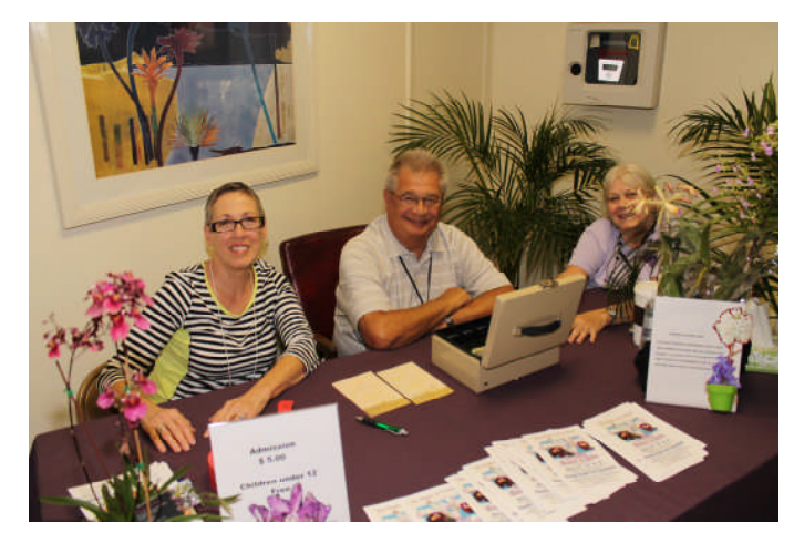
The 2014 Show PCOS show.....